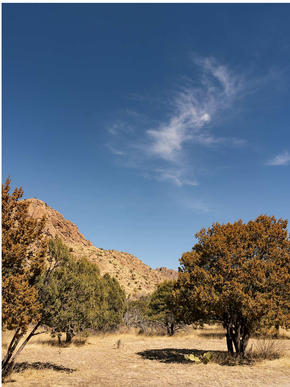
Peaceful Bonita Canyon