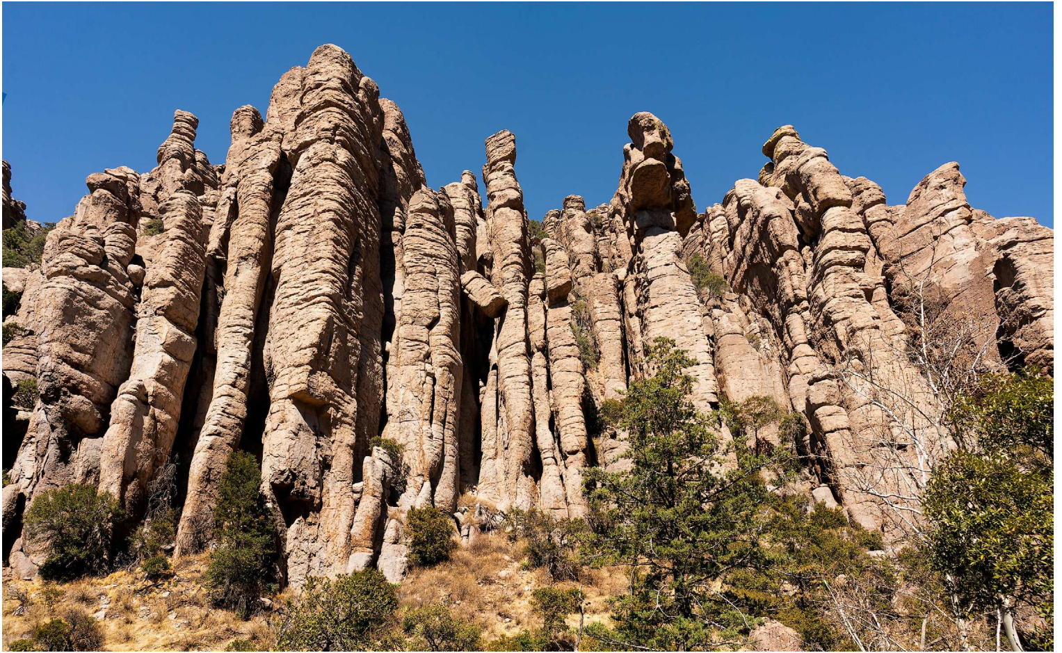
Organ Pipe Formation