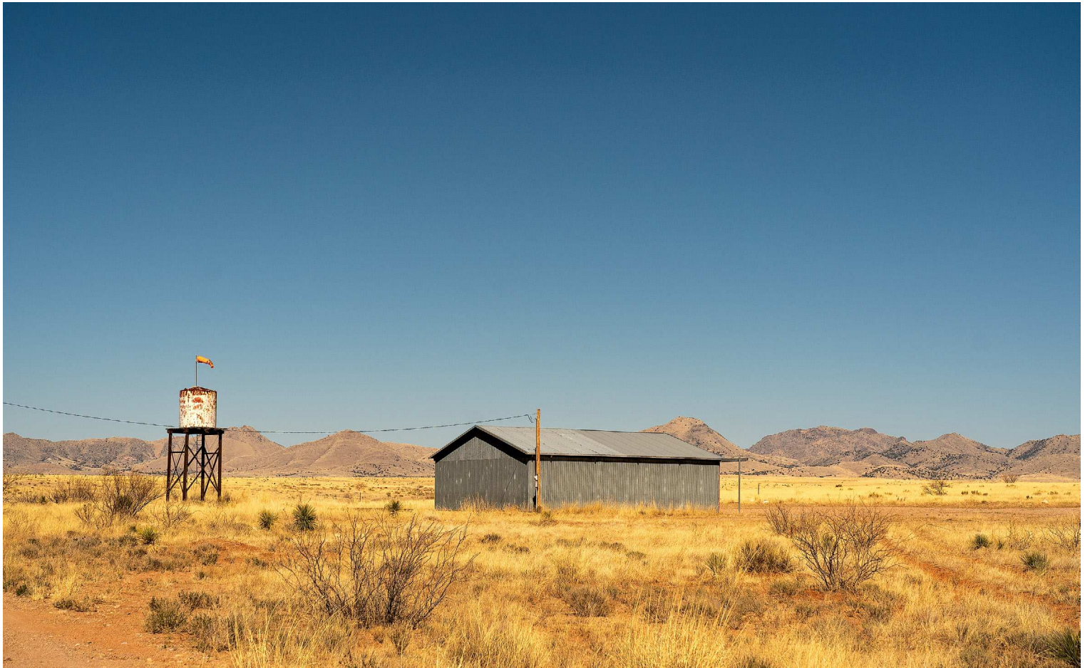
Ranch Landing Field