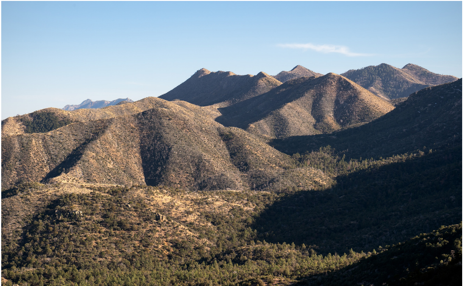
Chiricahua Wilderness Area