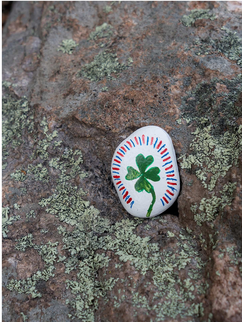
Shamrock on Trail