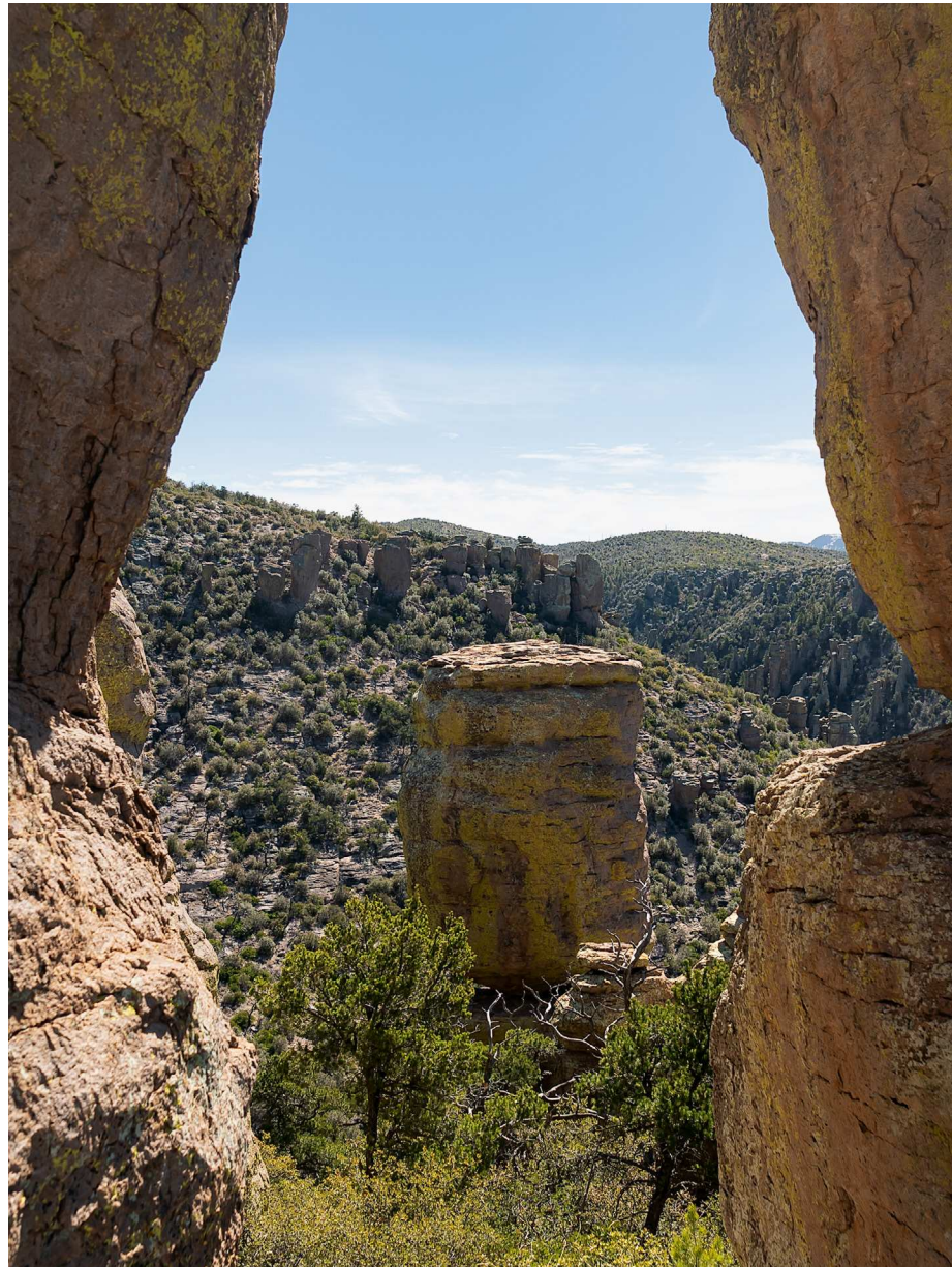
Beyond the Gate