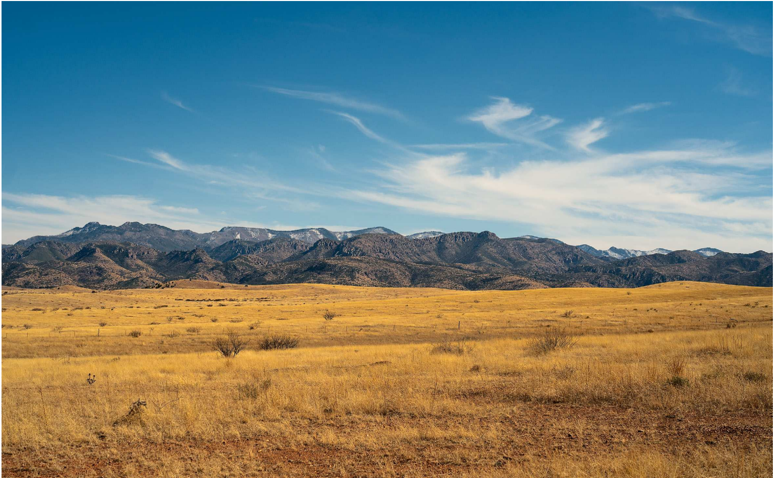
Snow on the Chirichuas