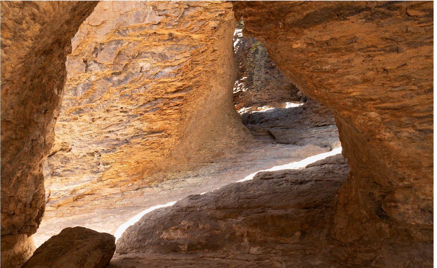
Inside the Grotto